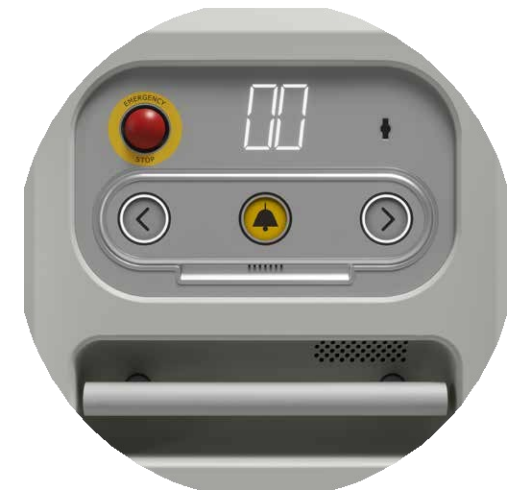
The integrated handrail blends harmoniously into the lift and has allowed us to produce a particularly slim design.