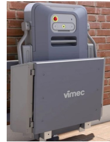
Choose a colour of your platform from our range of RAL colours to seamlessly blend the unit into your building.