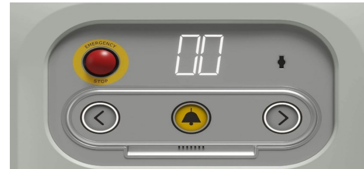
The graphic display panel will keep you up-to-date regarding the operating status of your lift and gives practical information and advice.